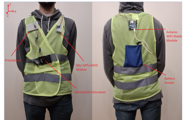
Fig. 1. Front and back views of the Equilivest prototype. The vest is based on a safety vest, with additional velcro pockets. The battery is located on the back, while the vibrotactile motor is located on the belly [11]. The IMU sensor is pressed against the chest by the use of a flexible elastic band.

calculated from a set of transforming equations and processed with a complementary filter which relies 0.98 in gyroscope data and 0.02 in accelerometer data [20]. These values are transmitted by telemetry in real-time as UDP packets for off-board register, processing and further analysis. Data recovered by the device is sampled at 100 Hz. The smart-vest prototype can be seen in Figure 1. It is based on a safety vest, complemented with Velcro pockets.